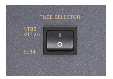
A side-mounted rocker switch changes bias to suit EL34s, KT88s and even KT150s PrimaLuna say.

I paired the PrimaLunas with Quadral's new Rodan 9 floorstanding loudspeakers reviewed in this issue, as well as our in-house Martin Logan