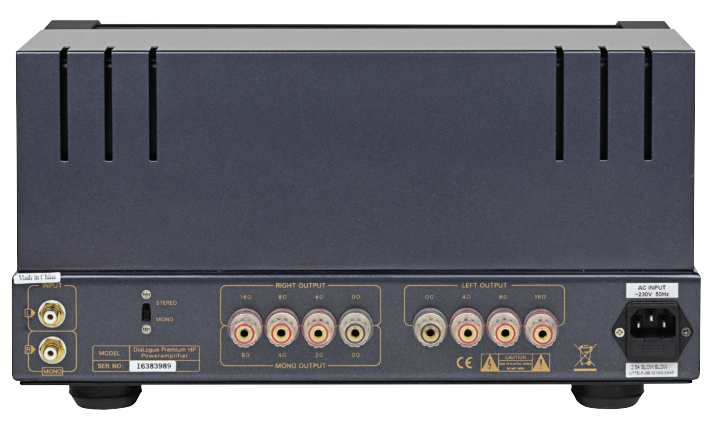
The stereo power amplifier has 4, 8 and 16 Ohm loudspeaker outputs, via sturdy gold plated terminals that accept 4mm banana plugs, spades or bare wires.

EL34 power valves in push-pull pairs, four per channel — eight in all. I mention this because valve replacement cost is an issue for some, as it can be if you're looking at 300Bs, for example, that cost up to £300 apiece. EL34s are plentiful and can be had at £60 or thereabouts for matched quads (i.e. 4), so a complete re-valve after 2000 hours or so — many years of use — is around £120.