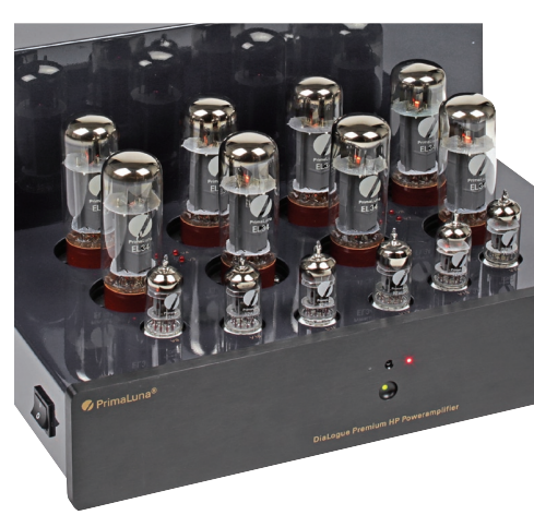
For high power, the output stage uses parallel push-pull pairs of EL34 power valves on each channel, seen at rear.